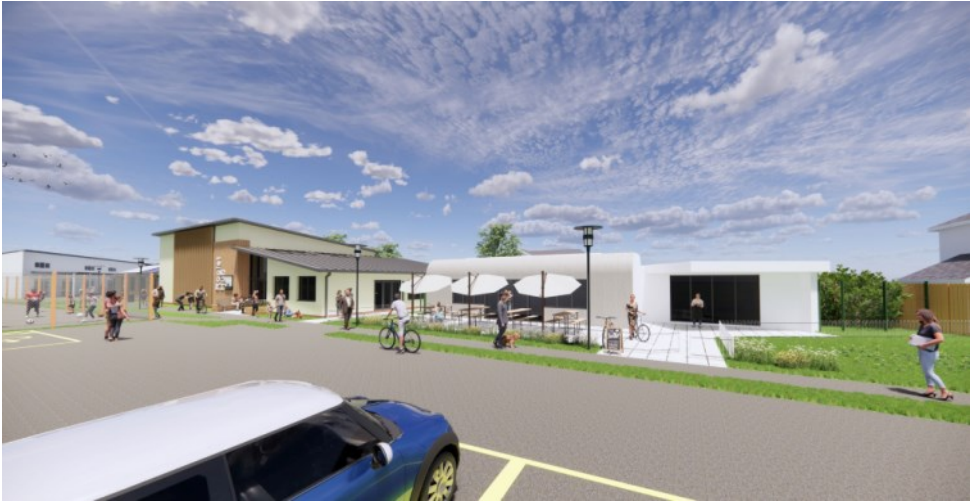
Perspective view of proposed hall alongside the proposed Community Café and Shop