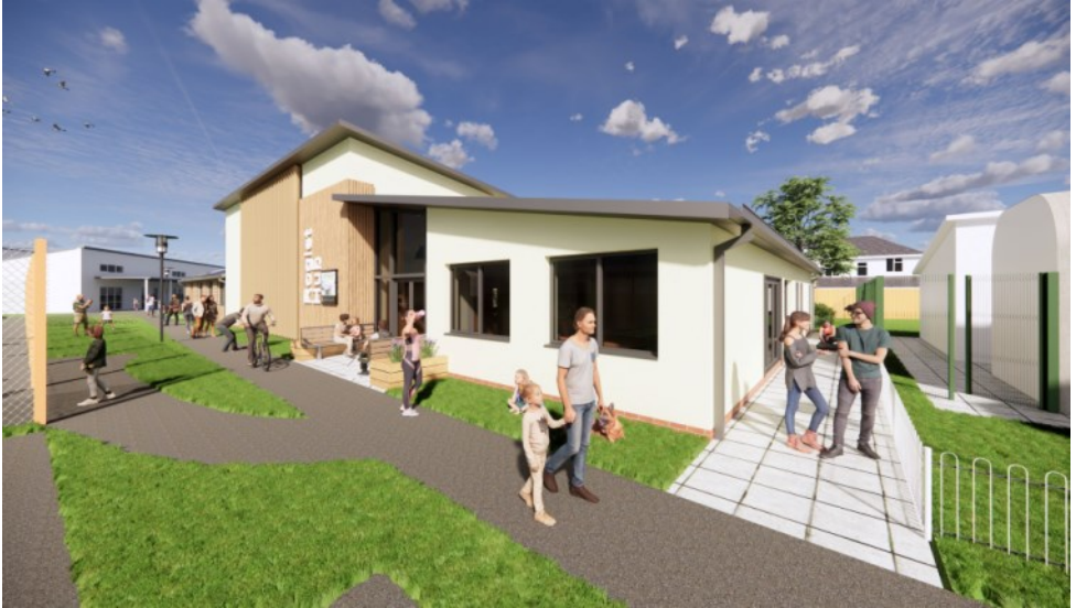
Perspective view of proposed building with main hall in the background