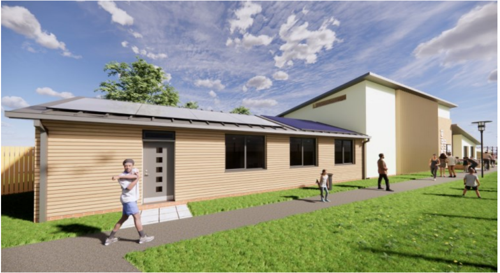
Perspective view of proposed building with the nursery in the foreground