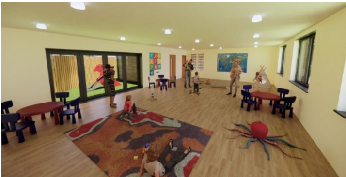
Perspective views of proposed hall and nursery